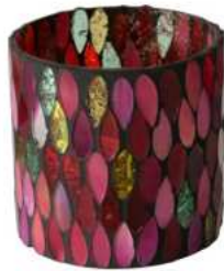
Capetown Spirit p. 40 + 41