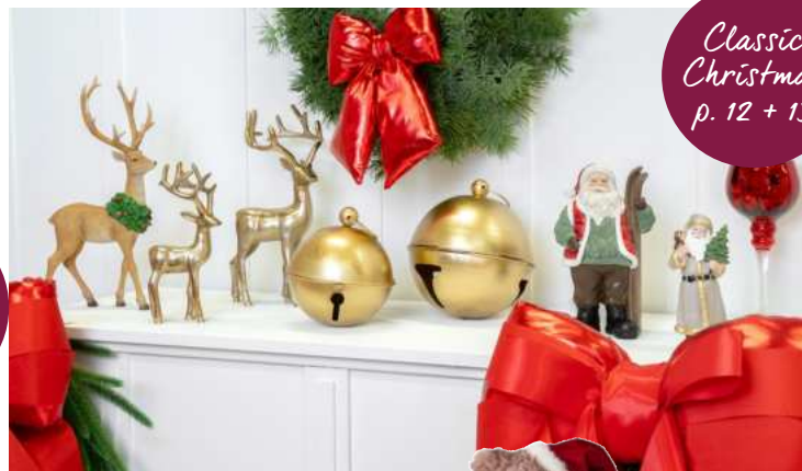
Classic Christmas p. 12 + 13

With joy in our hearts and inspirations to share, we wish you a shopping tour beyond compare!