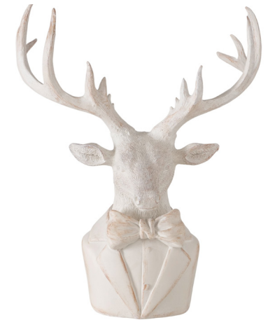
Item no. 2083180