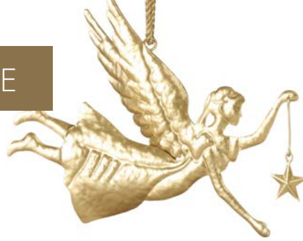
Item no. 2082490