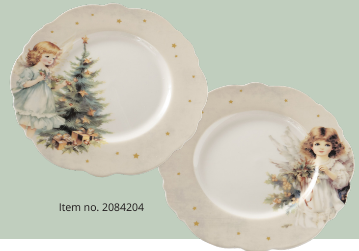
Item no. 2084204

Christmas tableware evokes memories – of festively laid tables, familiar patterns and the charm of times gone by. Our designs capture exactly this feeling, adding a warm and atmospheric touch to the Christmas table. For those who prefer a more modern twist and want to celebrate with a smile, we also offer playful designs with a cheeky wink.