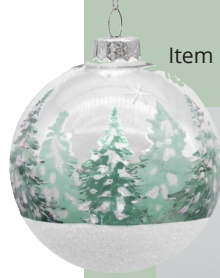
Item no. 2082813