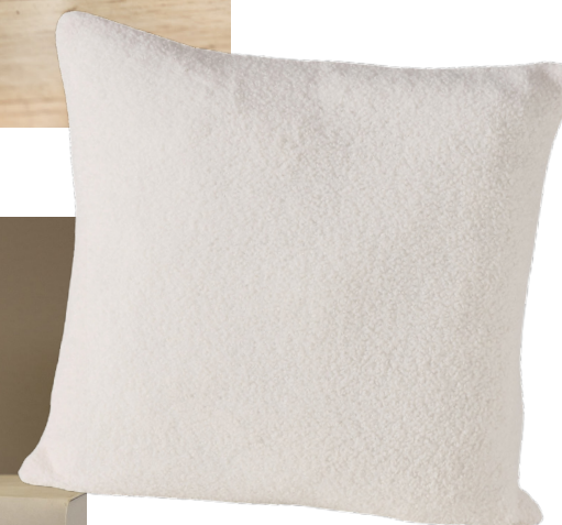
Item no. 2083995