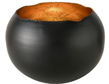
Item no. 2081384