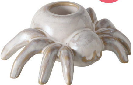
Item no. 2084537