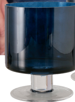
Item no. 2082805