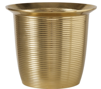
Item no. 2080463