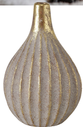
Item no. 2083316

The All-Season pendant translates the festive elegance of Glam of Nature into a soft, elegant-everyday style. Light wood, textured surfaces and soft textiles such as teddy fabric create a cosy foundation. Subtle brushed-gold accents and gently shimmering materials add a sense of refined lightness to the home. The result is a homely atmosphere that radiates calm and naturalness while embodying understated elegance.