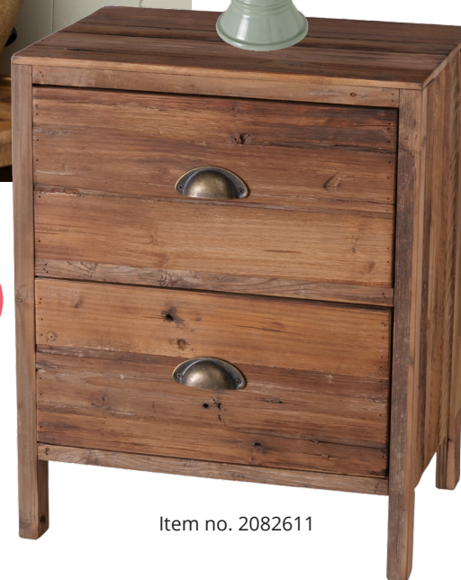
Item no. 2082611