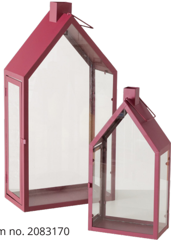
Item no. 2083170