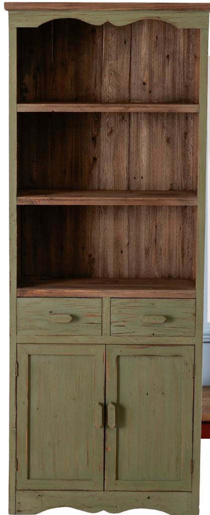
Item no. 2083771

Fresh colours bring new energy to the popular cottage look. Warm wood tones meet cheerful accents in yellow, red, green and blue, creating a homely atmosphere with a modern twist. Wood, textiles and hand-drawn motifs on ceramic turn each piece into a small work of art, adding individuality to your assortment. The result is a theme concept that blends tradition and modernity in a lively and charming way.