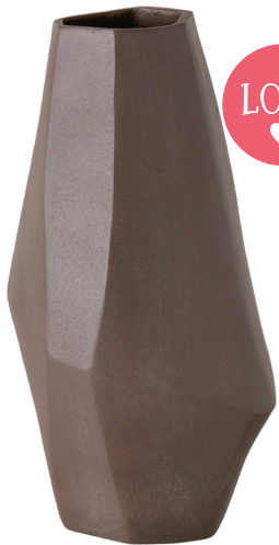
Item no. 2081391

Items: organic bowls, candleholders, vases