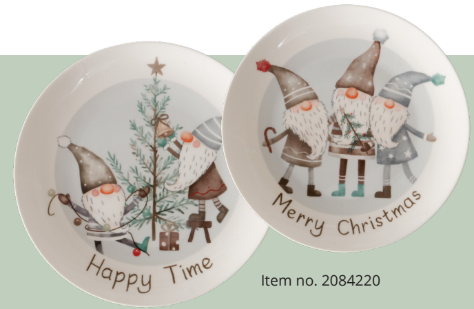
Item no. 2084220