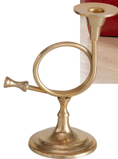
Item no. 2084896