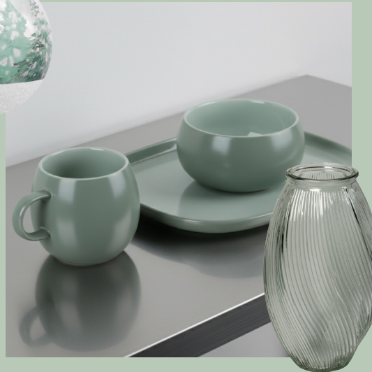
Item no. 2084531