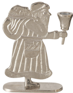
Item no. 2084087