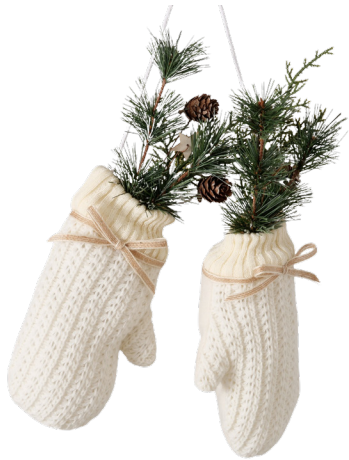
Item no. 2083770

Wood, pine branches, pine cones and candlelight – this look is rustic and full of comfort. Natural tones, taupe and sage green combine with silver accents to create a calm Christmas world. Our decorative pieces are defined by loving details that harmoniously complete the overall look. The result is an authentic Christmas range that evokes the longing for a cosy country-house winter and, with its homely charm, appeals to a broad audience.