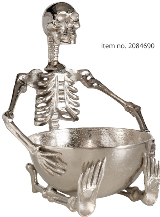
Item no. 2084690