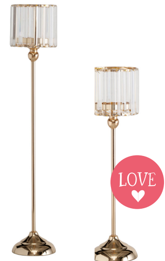
Item no. 2084104 & 2084103