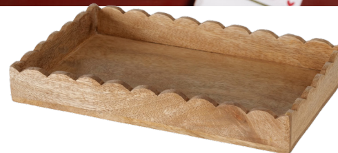
Item no. 2084272