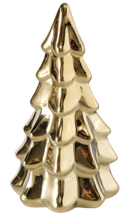
Item no. 2060359