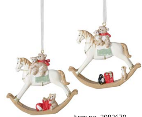
Item no. 2082679