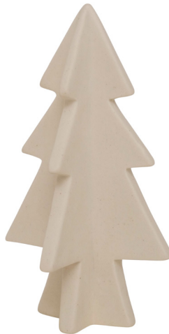
Item no. 2082933

chrome-look vases, burgundy lanterns, modern figurines