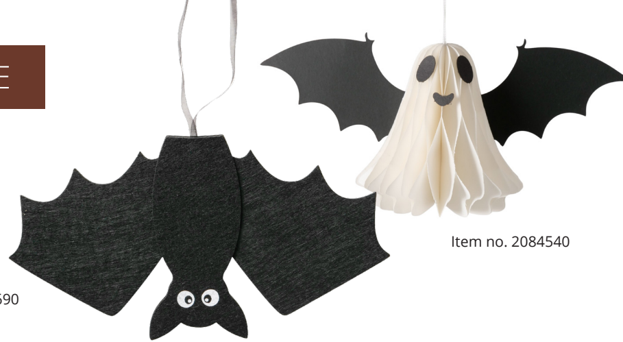
Item no. 2084540

Between golden light and rustling leaves unfolds a collection that blends modern country-house charm with autumnal cosiness. Natural tones such as beige, light grey and brown meet black metal and grey terracotta – timeless, homely and effortlessly relaxed. Subtle Halloween details, including carved pumpkins in beige and grey or bat silhouettes, integrate harmoniously into the overall look. In this way, two strong seasonal themes – autumn and Halloween – are combined in a stylish and cohesive way.