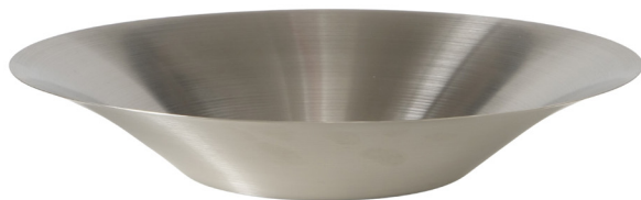
Item no. 2081307