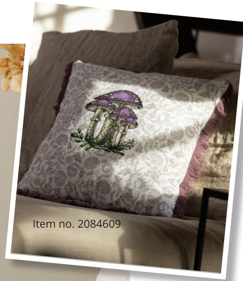
Item no. 2084609

Can be found in: Autumn Breeze (pages 16-17)