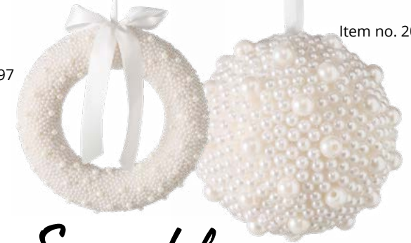
Item no. 2082792