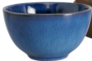
Item no. 2083717