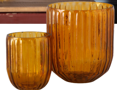
Item no. 2084705