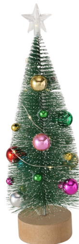
Item no. 2083401

Christmas tree ornaments, figurines, tableware