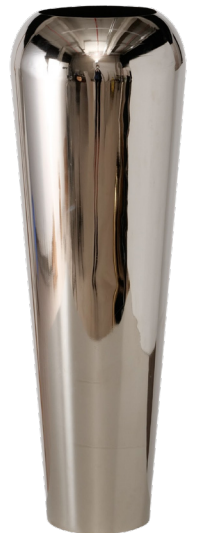
Item no. 2084715