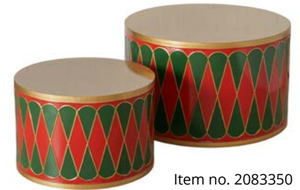
Item no. 2083350

Items: Santa Claus figurines, baubles, decorative hanging ornaments