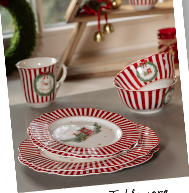
Christmas Tableware "Cavallo" Series