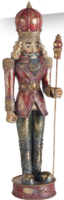
Item no. 2084594