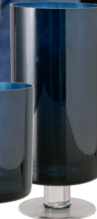
Item no. 2082806