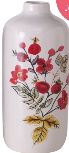
Item no. 2083420