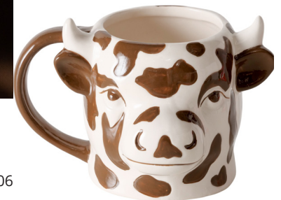
Item no. 2084128