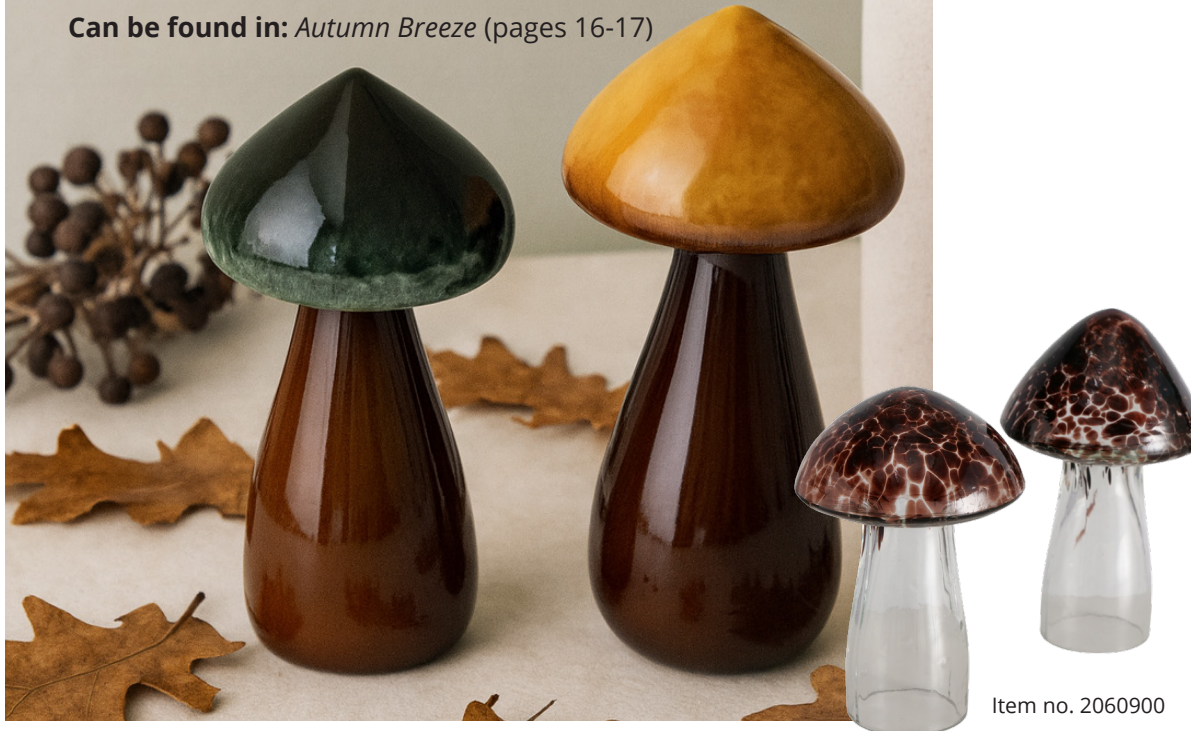
Item no. 2060900